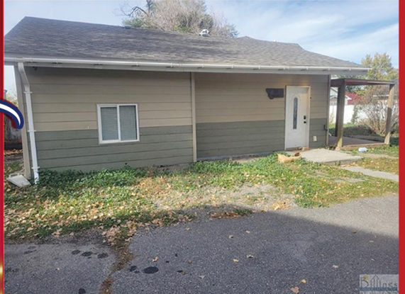
1210 HAWTHORNE LANE • BILLINGS, MT

Step into the livingroom w/ fireplace & vaulted ceiling. Kitchen & Dining on lower lvl. Master: 2 steps down from kitchen & laundry room w/ 1.5 bth down hall. Upper: 2 beds w/ full bath. Detached finished garage w/ automatic door opener, 4th in the row of gar. $230,000 • MLS#349452