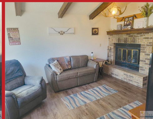
DON'T MISS THIS WELL-MAINTAINED 3 BEDS, 1.5 BATH TOWNHOME IN WEST BILLINGS - WHEATLAND TOWNHOMES SUBDN.

Step into the livingroom w/ fireplace & vaulted ceiling. Kitchen & Dining on lower lvl. Master: 2 steps down from kitchen & laundry room w/ 1.5 bth down hall. Upper: 2 beds w/ full bath. Detached finished garage w/ automatic door opener, 4th in the row of gar. $230,000 • MLS#349452