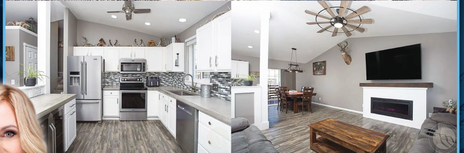
1742 STONY MEADOW LANE - BILLINGS, MT 5 BED | 3 BATH | 2,540 SQFT | 4,400 SQFT LOT

Welcome to your charming 5 bedroom, 3 bath home in Josephine Crossing! Nestled among vibrant, close-knit homes with unique character, this residence offers warmth & practicality. The main level boasts durable laminate flooring, vaulted ceilings, natural light, an open kitchen-living-dining layout with a handy desk nook & pantry closet, a guest bedroom & bath, plus the spacious primary suite with a bay window, bath, & walk-in closet. Upstairs is a flexible loft area serving as a 5th bedroom, gym, or office. The finished basement features a rec room, two bedrooms with egress windows, a bath, cozy nook for reading or desk area, & large unfinished storage room. Enjoy the fenced yard with garden beds, flowers, & shrubs. An oversized 2-car garage & welcoming front porch complete this gem. Relish summer concerts, festive fireworks, and communal park spaces in this enchanting neighborhood! $436,880 - MLS# 350148