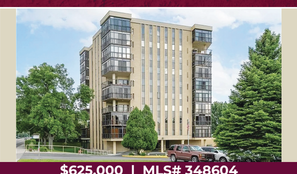
1400 POLY DRIVE APT 7CD • BILLINGS, MT

This 2,656 sqft 2 bds, 2 bth, condo is in a secure building w/2 elevators & offering 1 lvl living. Located near the downtown medical corridor w/shopping nearby. 2 Enclosed lanais w/ views. Other amenities include a swimming pool, hot tub, exercise area & a community room w/kitch. Building has 2 rental stes for guests & company. Two indoor covered parking spaces w/extra storage area included. Only one dog, under 25lbs allowed. Fantastic views!