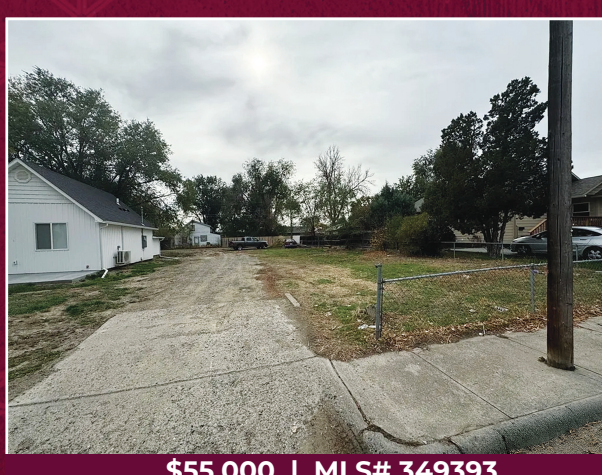
$55,000 | MLS# 349393