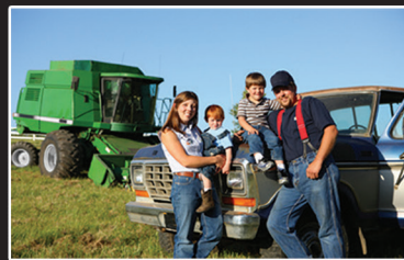
Property-casualty insurance products offered through Mountain West Farm Bureau Mutual Insurance Company, Laramie, WY